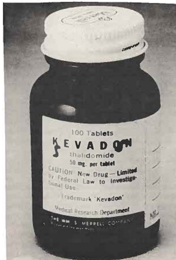
An investigational sample of thalidomide, which was shown to cause dramatic birth defects. It affected thousands of babies, mostly in Europe, in the late 1950s and early 1960s.

In 1984 the agency's history function—by this time housed in the Office of Legislative Affairs—was reinstated formally as the FDA History Office and placed in the Office of Regulatory Affairs. The latter, a descendant of the early chemists and inspectors in the Bureau of Chemistry and a part of the FDA especially rich with career employees, was a likely part of the agency to foster the growth of the history program. The History Office