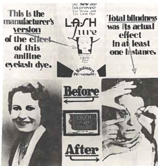
Lash Lure was one of the products FDA used to illustrate the many shortcomings of the 1906 Act.

maimed many patients in this country and thereby revolutionized drug laws in 1938 and 1962, respectively, as well as Lash Lure, a synthetic aniline eyelash dye that blinded many women in the 1930s, before cosmetics came under regulation.