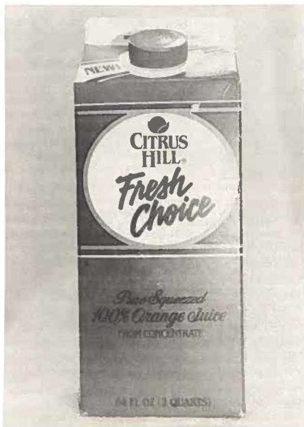
Under pressure from FDA in 1991, Procter & Gamble agreed to remove the word "fresh" from the labeling of its reconstituted orange juice.