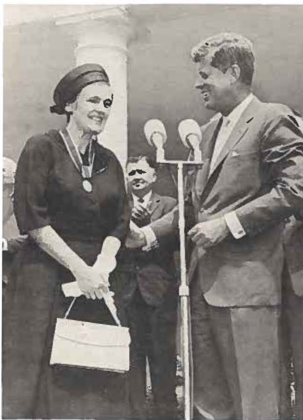
President Kennedy awards Dr. Frances Kelsey the highest recognition possible for civilian service in the federal government in 1962 for her efforts in keeping thalidomide out of general distribution in the United States.

Most of each NDA is confidential because of the commercial information required; in addition, there are privacy act concerns that prevent release of most of the NDA. However, there is still substantial so-called approvability correspondence that is releasable, and since the 1970s the FDA has issued a summary basis of approval (SBA) for each NDA, which distills the voluminous data and conclusions in the application (for other product approval documents, see Dockets Management Branch Files below, or consult the relevant Center). The History Office is working with a distinguished committee of outside and internal experts on drug information and the history of pharmacology to conduct a systematic examination of the NDAs. This effort will identify historically significant NDAs that will be permanently preserved in the National Archives, as well as randomly selected NDAs to capture changes in drug evaluation methodology over time.