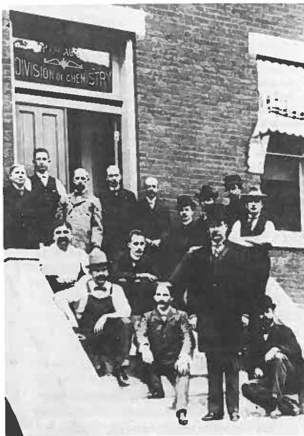
Harvey Wiley, in top hat and tails, on his way to make one of his many speeches for a federal food and drugs law.

drug, sulfanilamide. So-called Elixir Sulfanilamide employed an untested solvent for the drug, diethylene glycol, and eventually it killed over a hundred people, most of whom were children. The 1938 Food, Drug, and Cosmetic Act, which remains the basic law we have today, featured many provisions lacking in the 1906 act. For example, it mandated that all new drugs be proved safe before marketing, therapeutic devices and cosmetics become subject to regulation, and standards of identity and quality be instituted for foods. The law also formalized FDA's ability to conduct factory inspections.