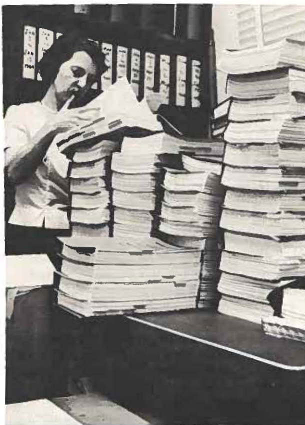
A drug reviewer pores over the many volumes of a new drug application

The agency's decimal files include the widest ranging topics of all the collections. These files, which represent the totality of the agency's concerns, are arranged by subject; each subject is given a discrete number between 000 and 999. The system, which is indexed alphabetically by subject and by number, has been updated constantly through time. For example, this system assigns food softeners the number 489.1, radio advertising for cosmetics is 580.71, complaints from businesses about enforcement methods is 691 whereas consumer complaints about the laxness of enforcement procedures is 609.3, counterfeit drugs are 500.24, exporting of medical devices is covered in 570.66, regulations for pesticides in foods is 051.12 (FDA regulations in general are covered under 051), and so on.