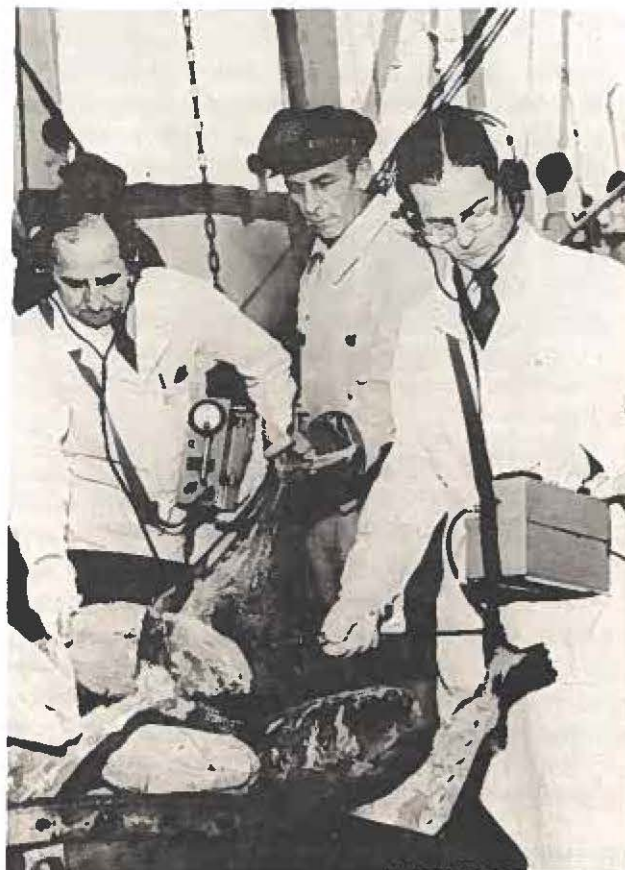
FDA officials examining seafood for possible contamination from atomic bomb testing in the Pacific during the 1950s.