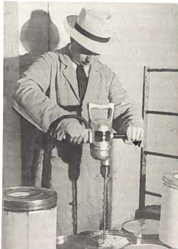
An inspector drills into a container of frozen eggs to collect a sample.

The Food and Drug Review began in 1917 as a means of communicating information privately to state food and drug officials to assist them in helping enforce the 1906 federal act. Soon the Review became a vehicle for FDA headquarters to inform field offices about relevant publications, speeches by FDA staff, personnel changes in the agency, the status of legislation, enforcement activities in other field offices, and so on. In many ways the Review is a sort of diary of activities at FDA, issued monthly with illustrations and indexed annually (except the last three volumes). A few research libraries have purchased microfilm copies of the Review , which ceased publication in 1966. Microfilms are still available through the Library of Congress. The cumulatively indexed FDA Papers —which changed its name to FDA Consumer in 1973—succeeded the Review , but its thrust was very different than the Review , emphasizing articles of interest to consumers, as the newer title suggests, and including the official summaries of agency enforcement activities (see below). FDA Today , a monthly employee newsletter with illustrations that began in 1974 and is still published, probably was closer in scope to the Review , but it was much less comprehensive than the Review .