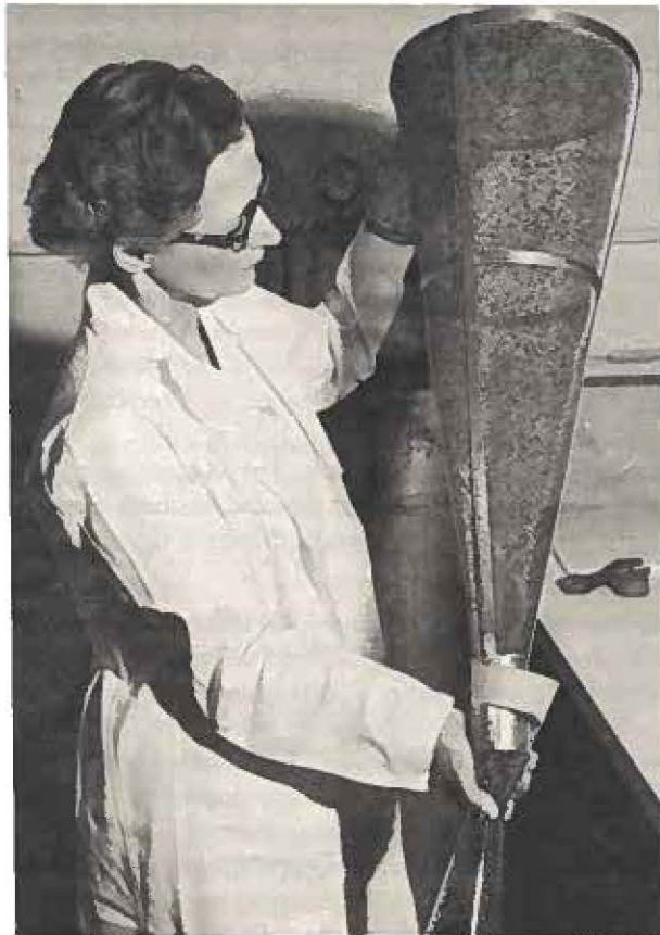
An analyst conducts a "flyo-assay," a biological assay for pesticides that employs house flies to determine the toxicity of a substance.

under the Federal Food, Drug and Cosmetic Act, required by provisions of the laws. These were published in groups of fifty by the Department of Agriculture (and later by the Federal Security Agency and the Department of Health, Education and Welfare) beginning in 1908. They summarize the government's case against a product, including the evidence of a product's adulteration or misbranding; often the notice will include a chemical analysis of the offending product. The Notices report the outcome of the cases as well.